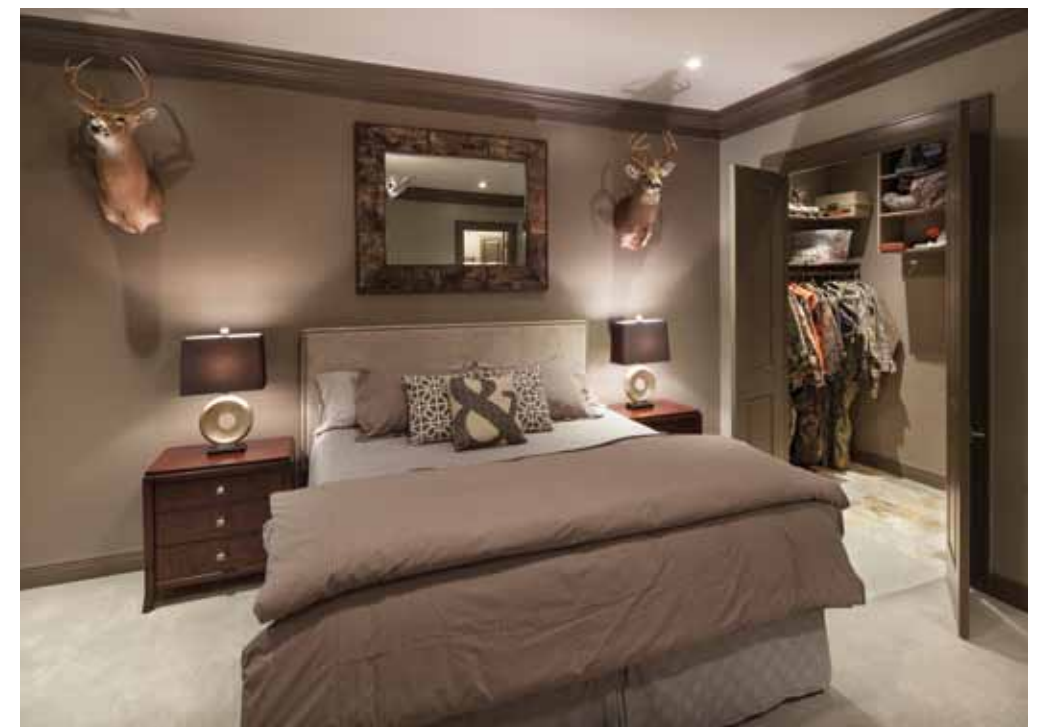
This page, top: Wood-look tiles give this bathroom the look of an outhouse, with "peepholes" depicting Old South scenes painted by Sarah Heringer's cousin, Cheryl Draper. Above: One of two bedrooms features a hunt closet, complete with washer and dryer. Opposite, top: The 13-seat theater looks like the bridge of a space ship. Below: The concession stand in the theater's lobby.